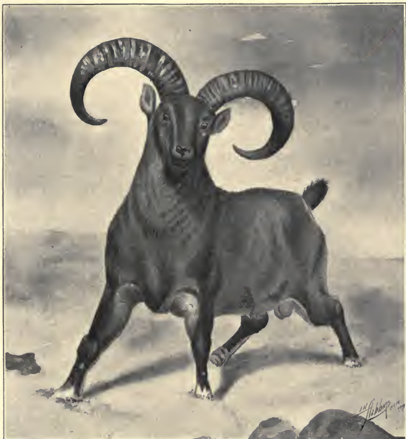
FIG. XXI. CAPRA CYLINDRICORNIS. EAST CAUCASIAN TUR.